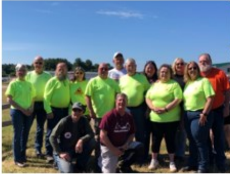
Most of the gang at the Airfield.

Glorious weather shown down on us for the 2022 Bugs for Breakfast ride. After applying our targets, we started our ride in Manchester and stopped for breakfast at the Airfield Café in Hampton. We returned ending our ride at Panera in Derry. About 80 miles of sunshine and winding back country roads.