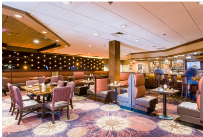
Greenfield's Restaurant & Seven South Tap Room