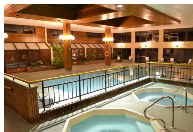
Indoor Heated Pool, Hot Tubs & Fitness Center